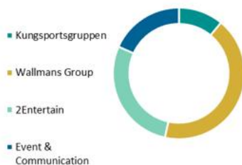
THE BUSINESS AREA'S SHARE OF THE QUARTER'S SALES