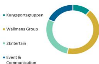
THE BUSINESS AREA'S SHARE OF THE QUARTER'S SALES